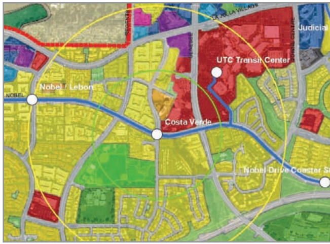
Land Use Map: 1/4 and 1/2 mile radius away from transit stop