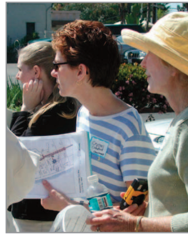
Walking tour participants