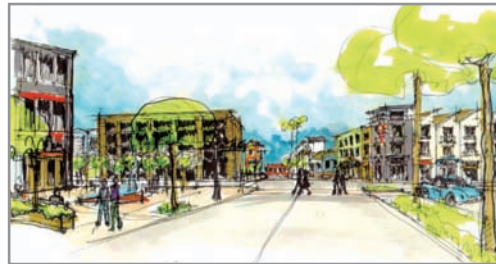
Gateway Entry Perspective