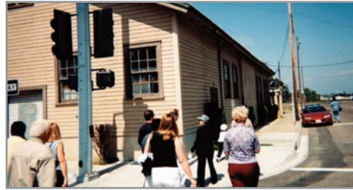
Community Participating in Walking Tour